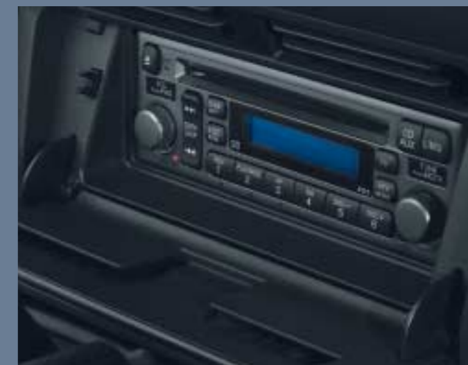
The Honda S2000's integrated in-car entertainment system, not only features a state of the art radio system, but also comes with a CD player.