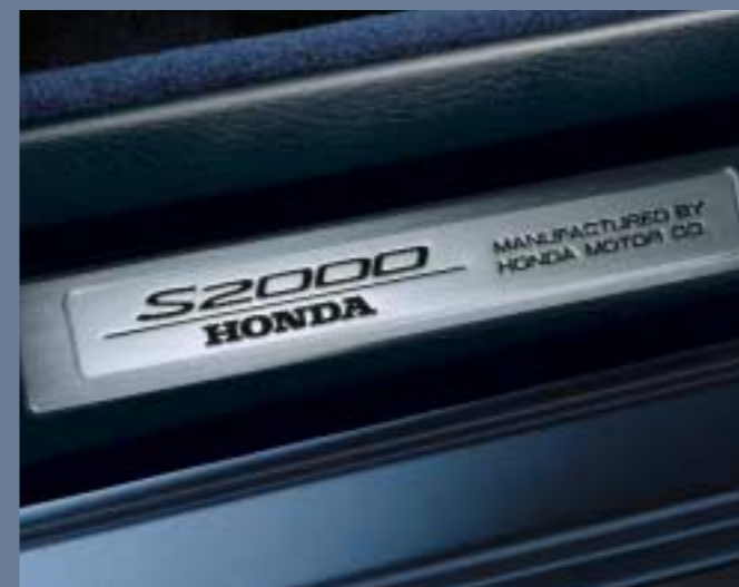
As you climb into the car, you are greeted by a high quality embossed kickplate.