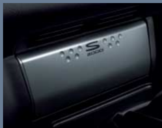
To conceal the radio from prying eyes, it is hidden behind the smart brushed aluminium panel.