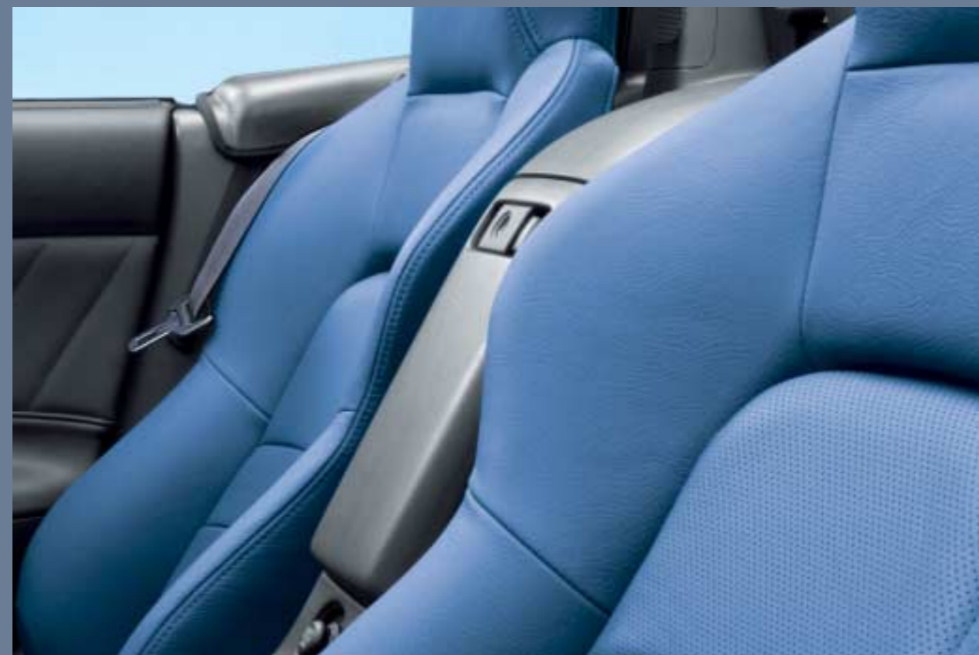
Lockable storage between the two seats encompasses the boot release and has two small bins at the top so you can keep your car tidy.