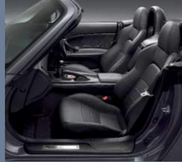
Black leather is available with all exterior colour options, except Nuerburgring Blue Metallic.