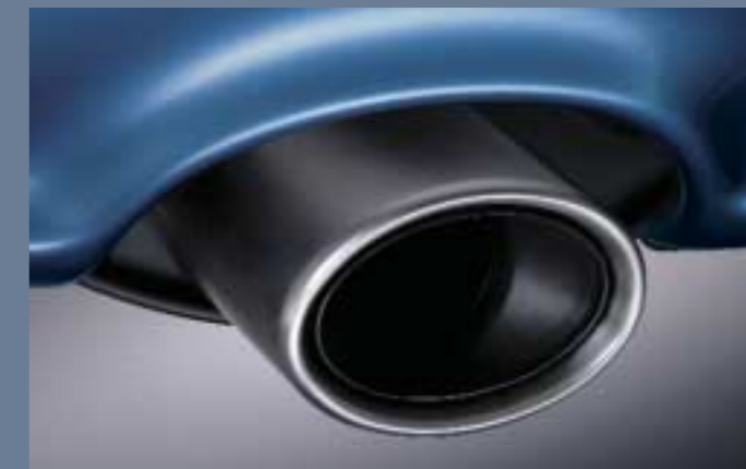
An eye-catching chrome finish gives the rear exhaust pipes a striking, sporty look.