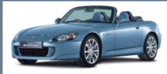
Nuerburgring Blue Metallic*