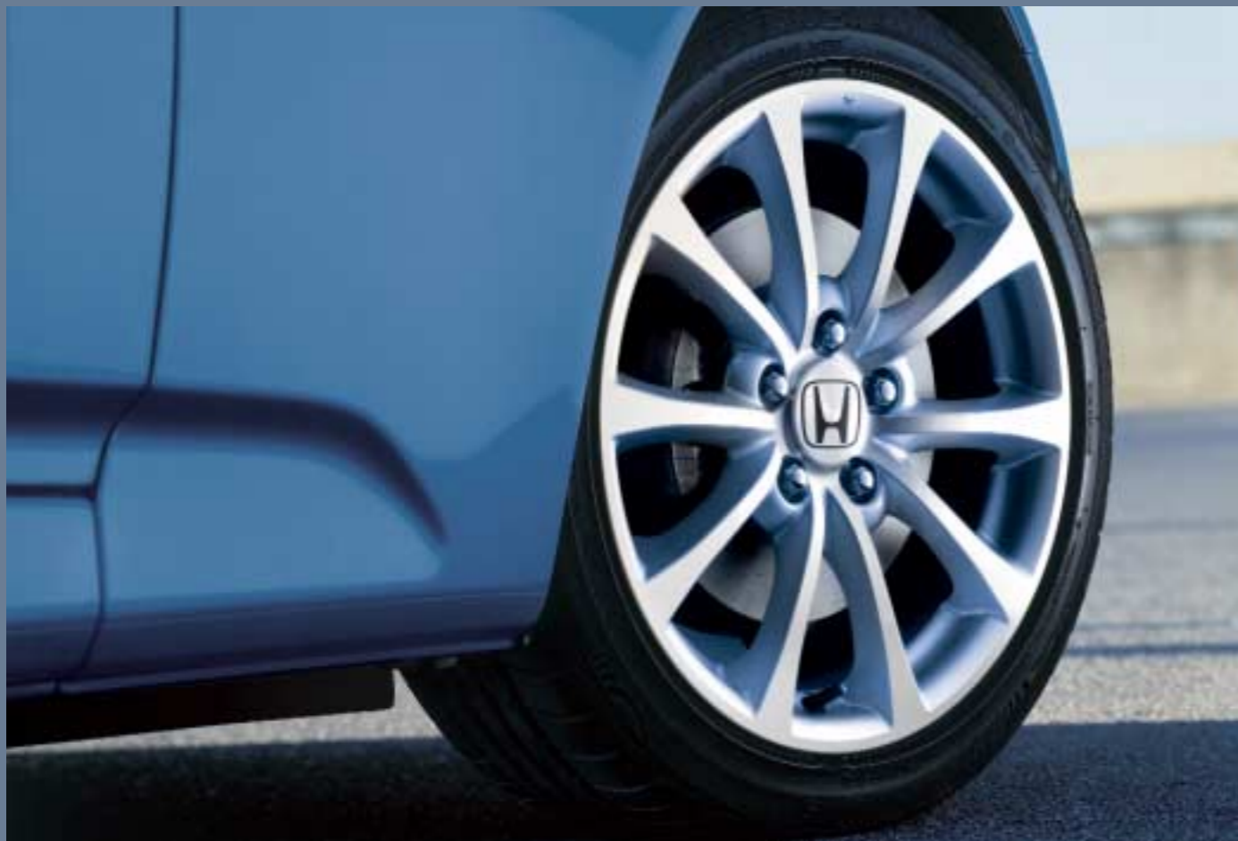
Impressive new 17" alloy wheels don't just look good but provide optimum grip.