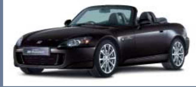
Deep Burgundy Metallic**