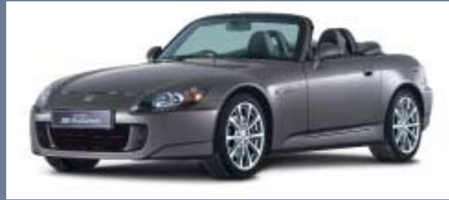
Moon Rock Metallic*