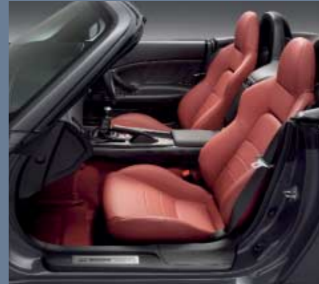
Red leather is available with Berlina Black, Moon Rock Metallic, and Silverstone Metallic.