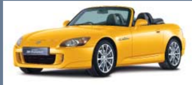
New Indy Yellow Pearl**