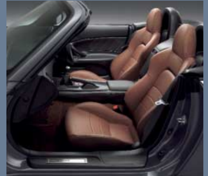
Brown leather is available with Berlina Black, Moon Rock Metallic, Royal Navy Blue Pearl and Deep Burgundy Metallic.