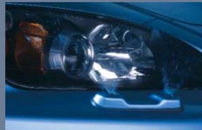
To ensure that the HID headlamps maintain their efficiency, powerful headlight washers are fitted as standard.