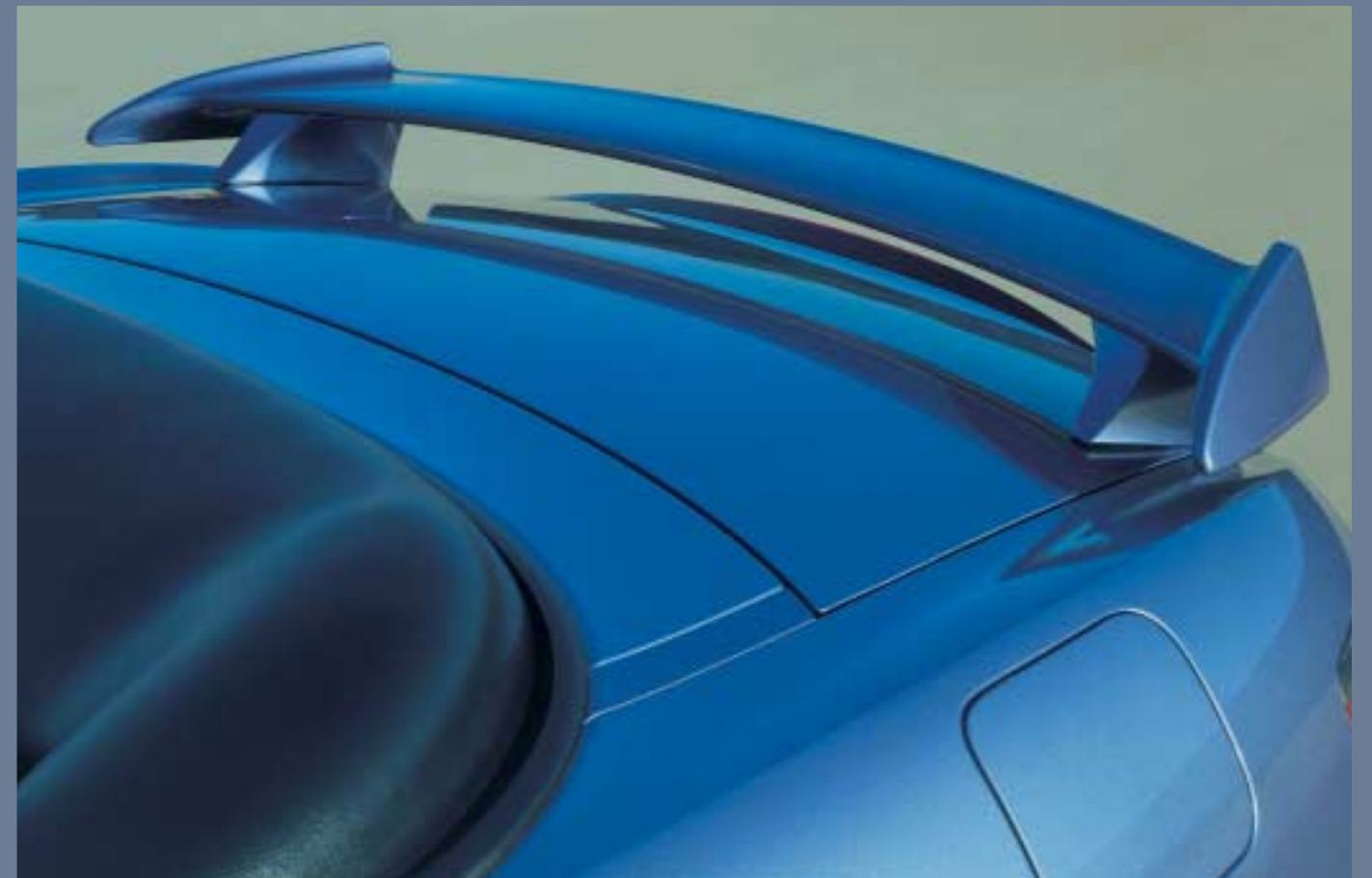
Subtle or sporty. Choose from either the high wing spoiler (pictured) for a more sporty look or a smaller, understated version.

The above are a selection of popular accessories. For a full listing please refer to the price list or your local Honda dealer.