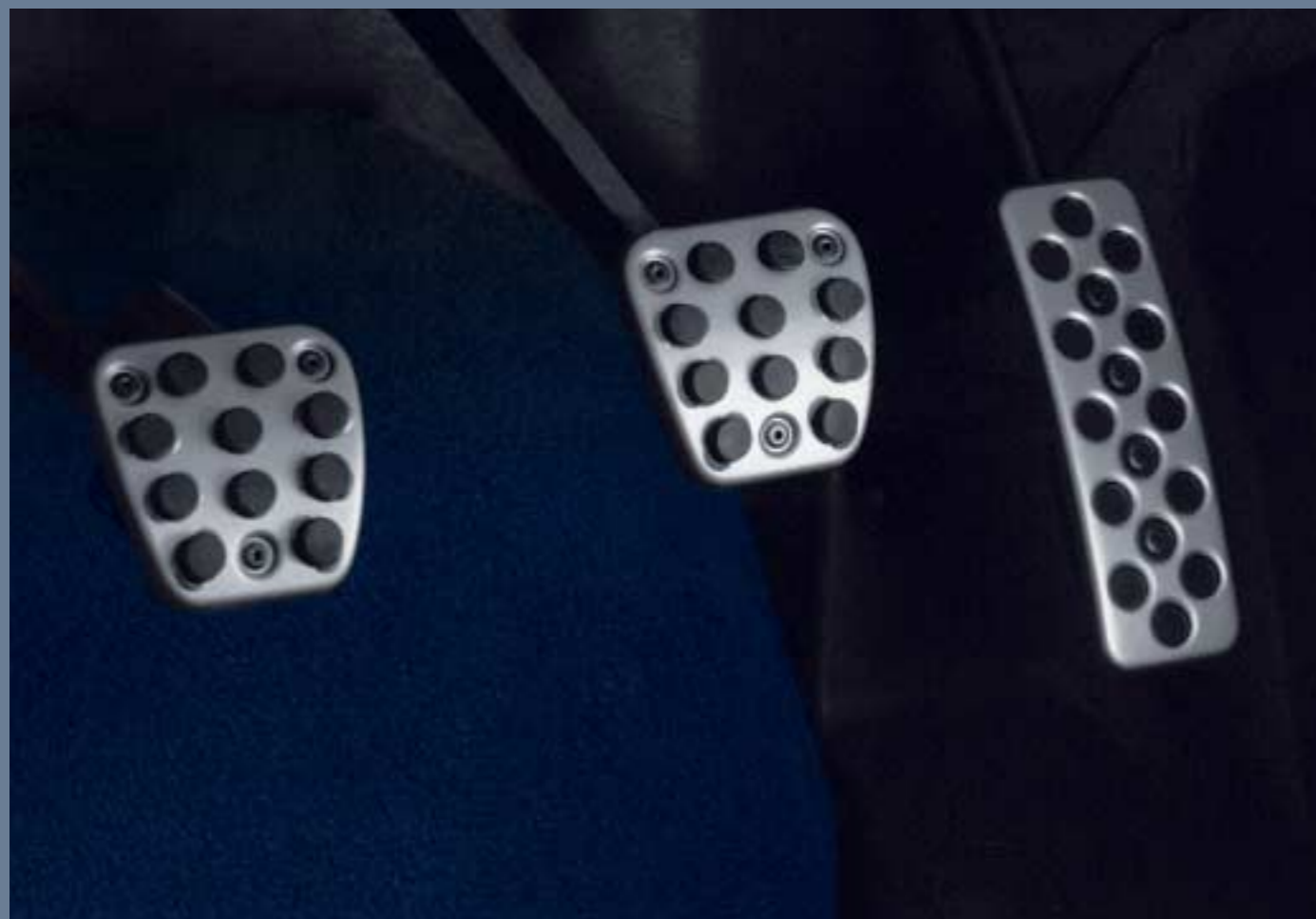
The foot pedals are aluminium alloy making them light and sensitive for instant, precise responses.