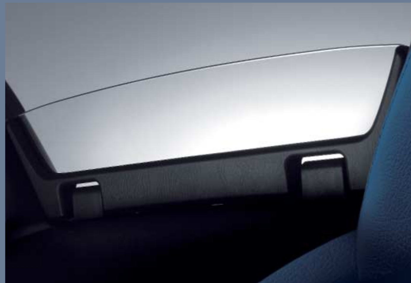
Turbulence in the cabin is reduced, thanks to the folding wind deflector, located between the rear headrests.