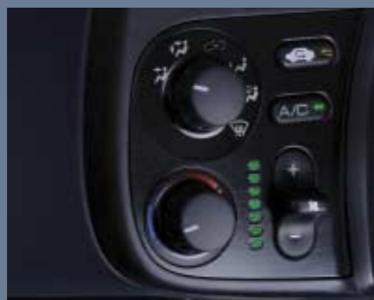
For occasions when it's impractical to drive with the roof down, you have the option of air conditioning for interior temperature control and optimal visibility, all at your fingertips.