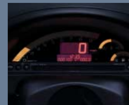
The Honda S2000's instrument panel is an easy to read digital display.