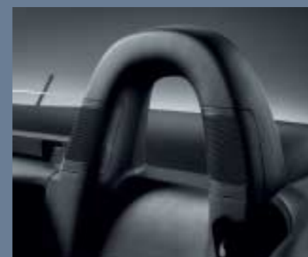
Roll bar speakers mounted in the headrests maximise sound quality with the roof down.