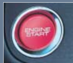
Race inspired engine start button