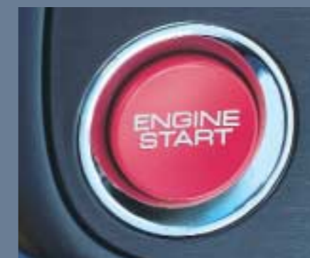
Race inspired engine start button.