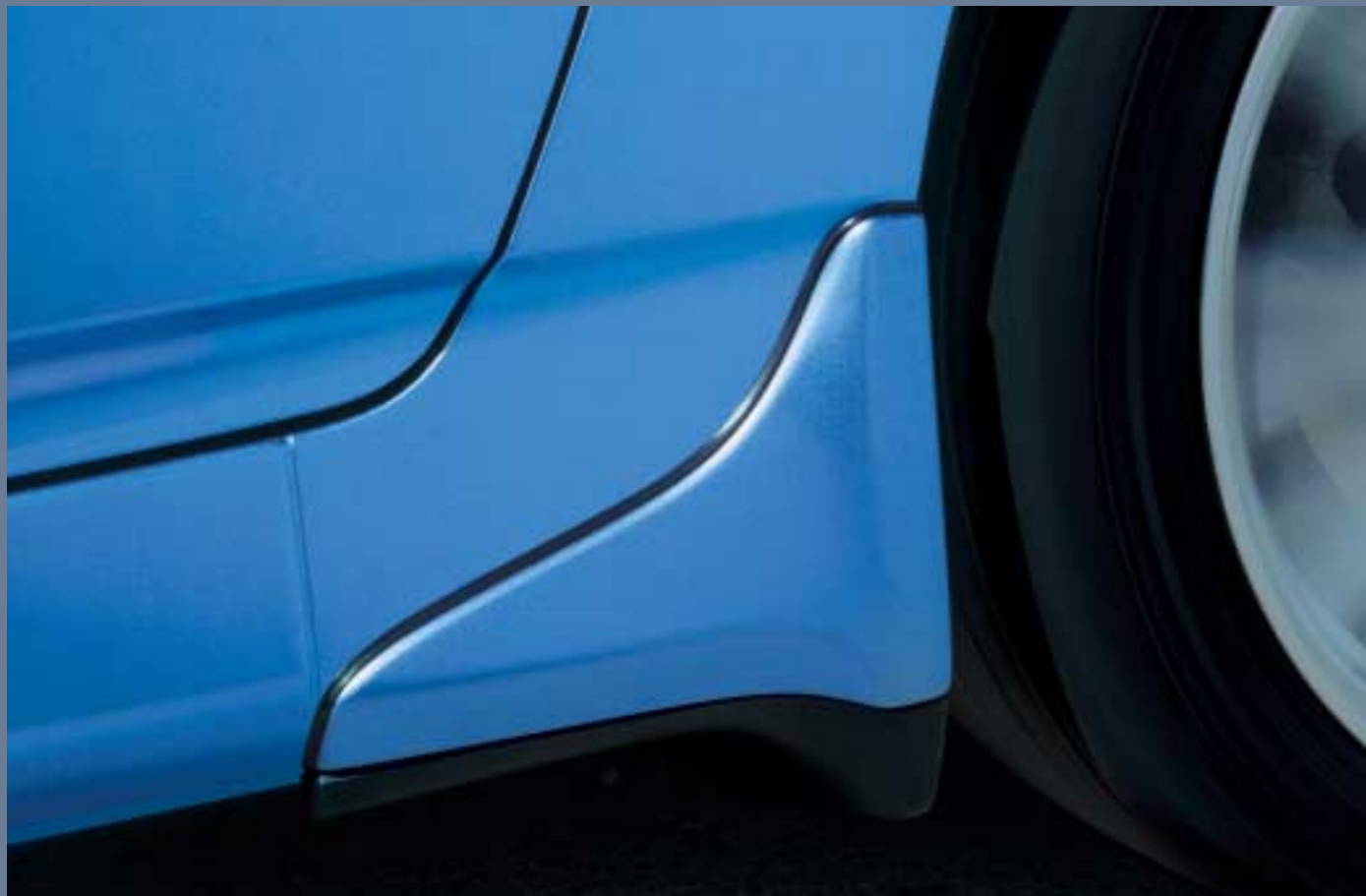
To provide the finishing touch to the Honda S2000's smooth lines, aerodynamic panels are available. These further smooth the airflow past the car's impressive rear tyres.