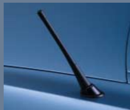
The flexible radio aerial provides exceptional reception for the Honda S2000's integral radio.