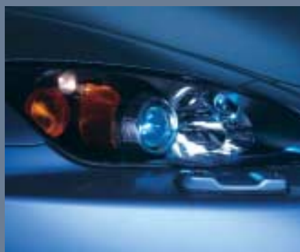
Triple beam projector headlamps providing powerful HID illumination in low light conditions, sit behind impact resistant, aerodynamic covers.