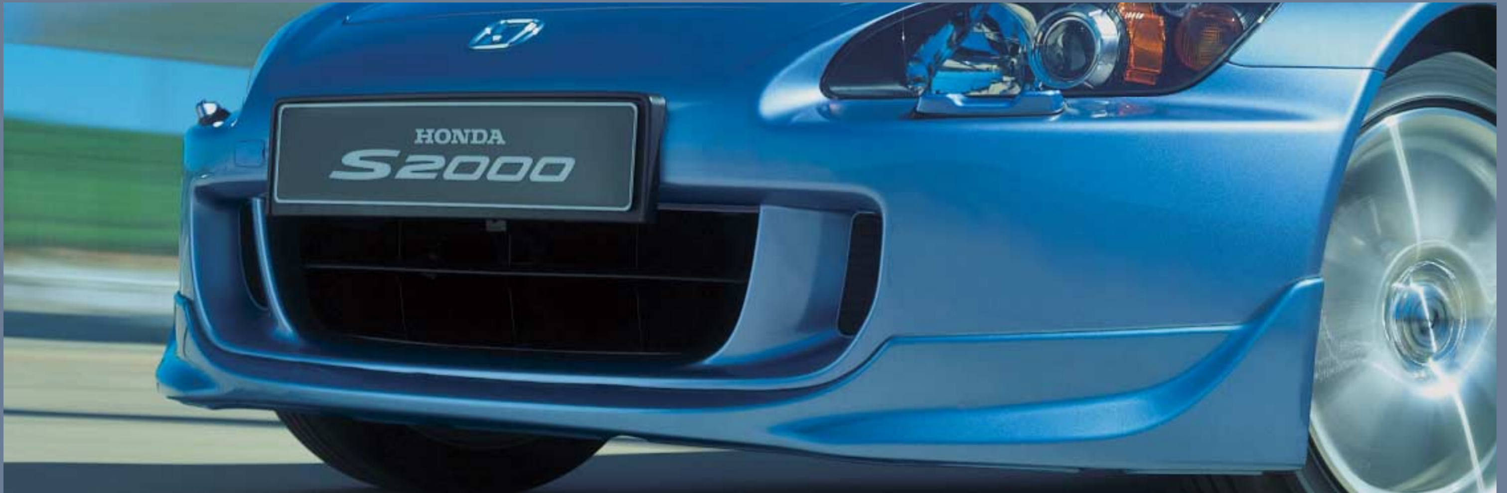
To give the car's exterior a more purposeful stance, there's an option of a deep front spoiler.