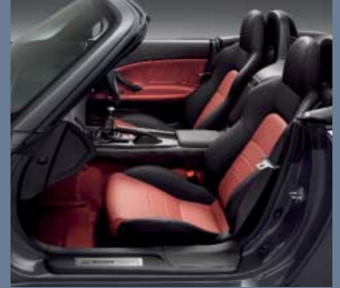
Red and Black leather is available with Berlina Black, Moon Rock Metallic, and Silverstone Metallic.