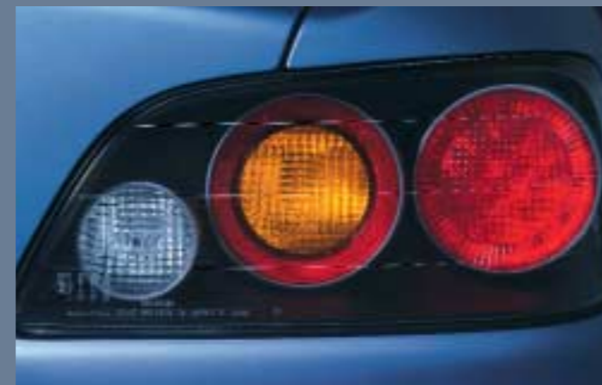
High intensity LED rear brake lights sit with the reversing and driving lights behind impact resistant aerodynamic covers.