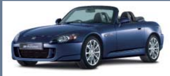
Royal Navy Blue Pearl*