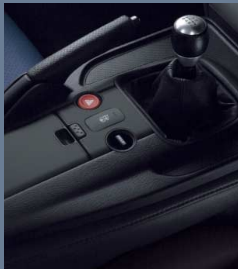
For extra convenience, the centre console provides two cup holders plus a storage tray, accessed instantly with a one-touch-open sliding lid.