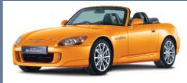
Imola Orange Pearl**