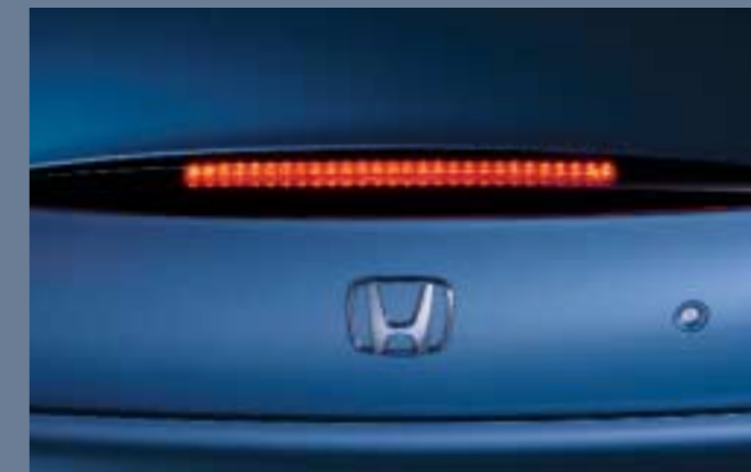
The high level, high intensity rear brake light provides additional safety and further improves aerodynamic performance.