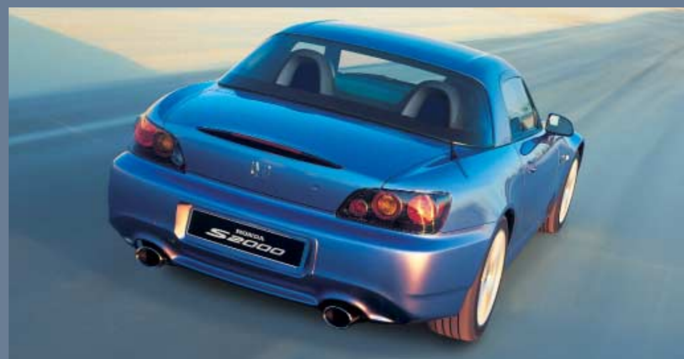
2.0i VTEC GT