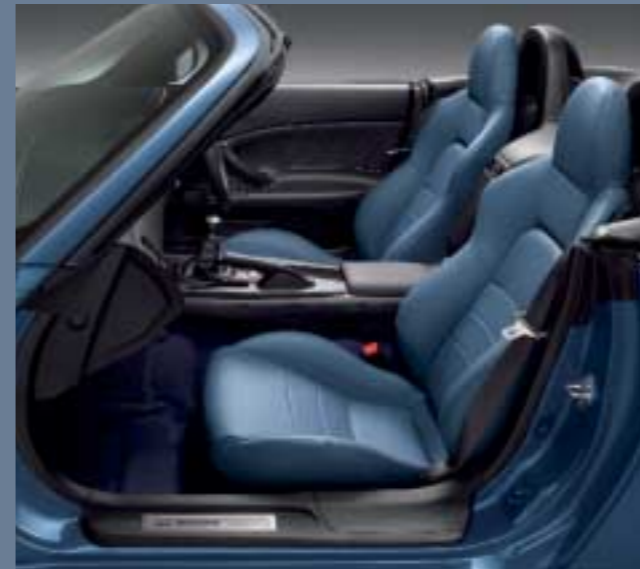
Blue leather is available with Nuerburgring Blue Metallic.

The Honda S2000 is available in an extensive range of new striking colours. All interiors are fitted with high-grade, luxury leather in a choice of colours, that reflect the exterior colour selection. Smart aluminium and chrome finishes feature throughout, further enhancing the stylish design of the Honda S2000. Please contact your local dealer for further information.