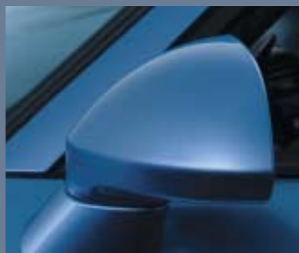
You'll love to drive the Honda S2000 even when the sun's not shining, so the mirrors have heated elements behind the glass to improve rear visibility.