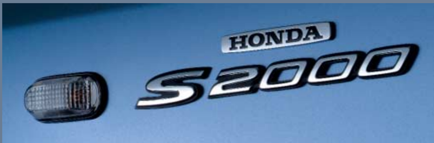
This chrome badge completes the car's high quality exterior look.