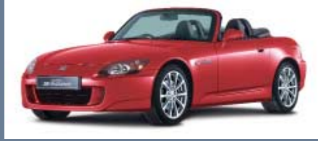
New Formula Red