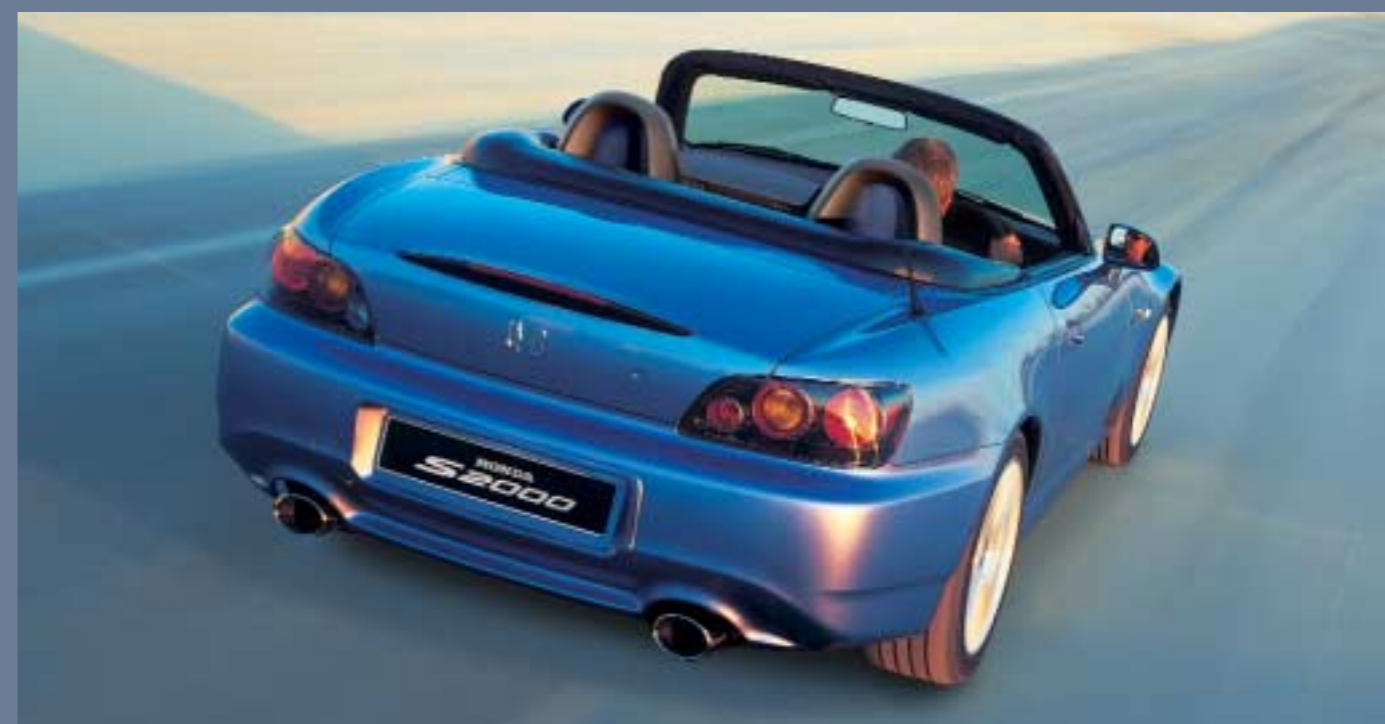
2.0i VTEC Roadster

The Honda S2000 is available in two models, the soft-top convertible 2.0i VTEC Roadster or with a removable hardtop as the 2.0i VTEC GT.