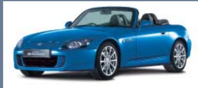
Bermuda Blue Pearl**