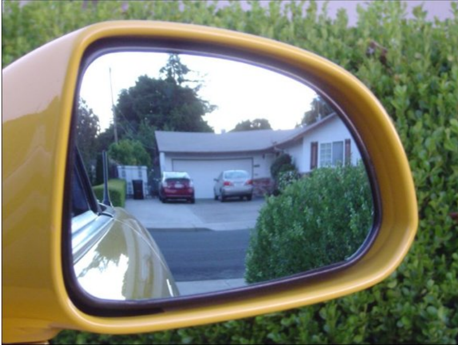
Step Six: Admire your new mirrors!