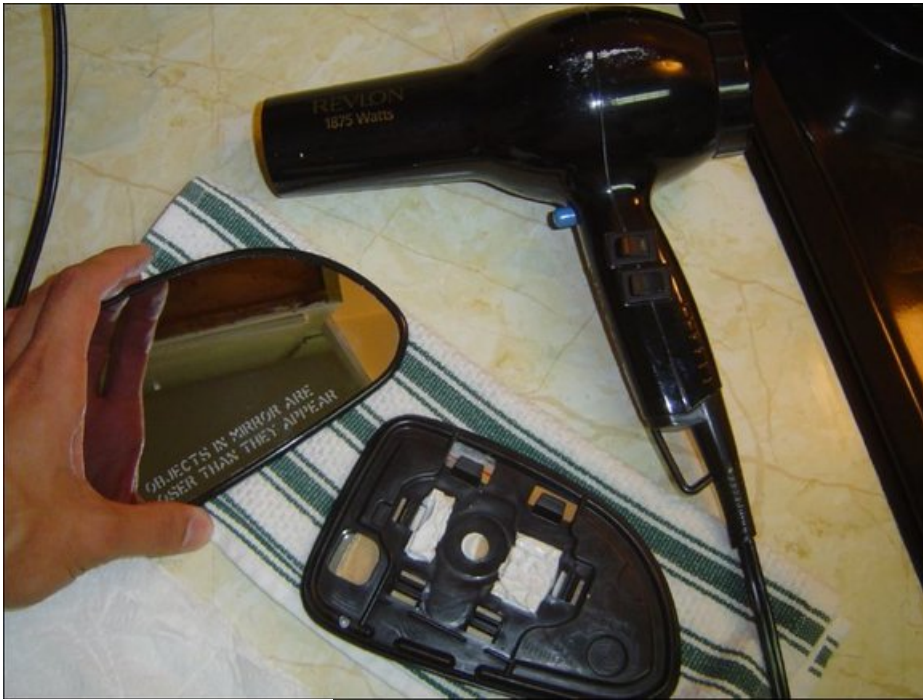
Revlon power baby... oh yeah.