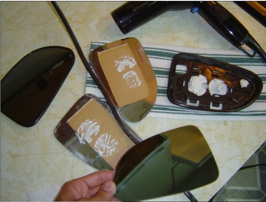
All the sticky-tac is pure JDM... hahaha