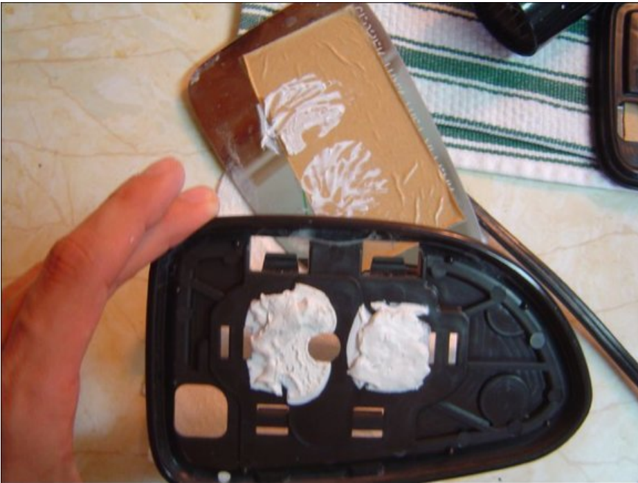
After removing all the sticky-tac from the old glass I replaced in onto the plastic frame. I figure any little bit of help holding my new investment in place can't be bad.