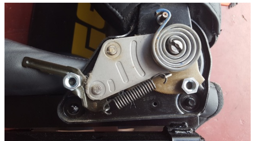
included 17mm bolts instead of the stock hardwareInstallInstall

Thread the plastic cover back through the exposed lever and position it back into place. Again this might require some finesse but it shouldn't be too bad.