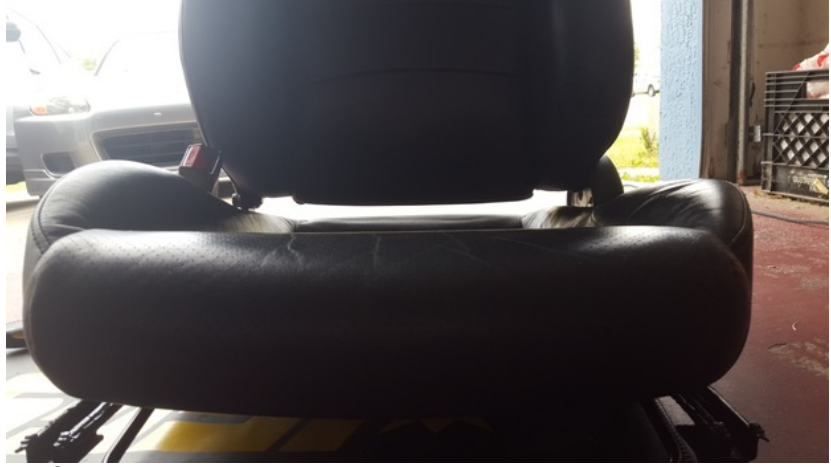
BYS lowered rail

Don't sit down! Wait until the seat is back in the car before testing it. Otherwise you could damage the seat belt sensor, since that's what the seat is resting on.