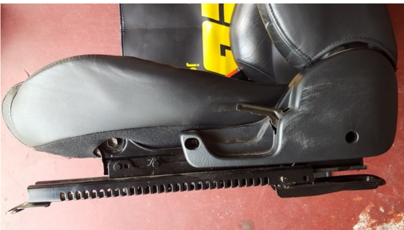
hereUse included new screw here

Use the small screw that came with your new seat rail on the front hole (the one closest to the front of the seat). Use the stock screw to screw in the rear hole.