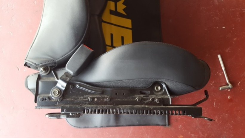
threaded through rail (Not visible)

Flip the chair over to the right side. Note the way the seat belt wiring is routed through the rail. When putting your new rail on you'll need to thread it through the same way.