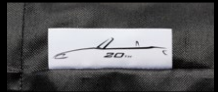
20th anniversary logo tag