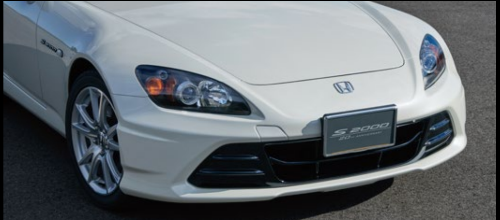
※ license frame are not included in the product.